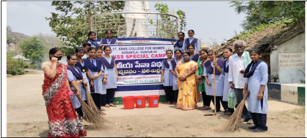
NSS volunteers participated in Swachh Bharat programme

Special Camp conducted by UG NSS volunteers from 29-03-2022 to 04-04-2022 at TatireddyPalem(lam) Guntur, NSS volunteers and students actively participated in swachhbharat on 04-04-2022