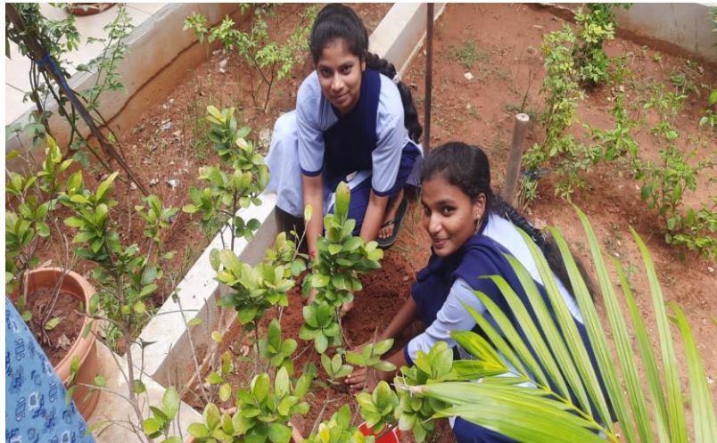
NSS volunteers participated in VanaMahotsavam