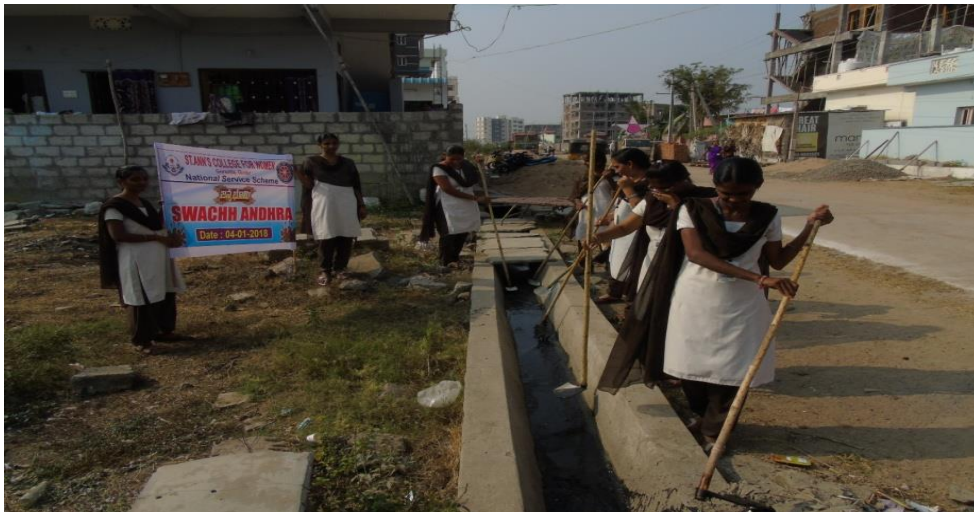
NSS Volunteers Participated Swachh Andhra Programme