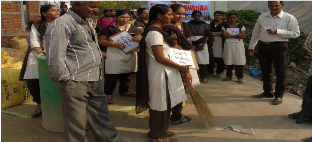
NSS volunteers participated in Swachh Bharat