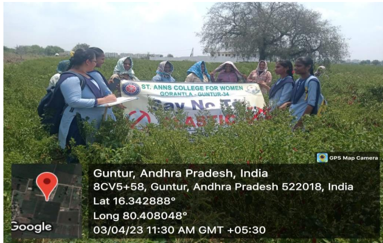
NSS volunteers participated in awareness program on Plastic Ban

Special Camp Conducted By NSS Volunteers (III B.Sc, B.Com & BCA)at Adavithakkellapadu, Guntur from 28-03-2023 to 03-04-2023.The Awareness program on Ban of Plastic was organized in 03-04-2023