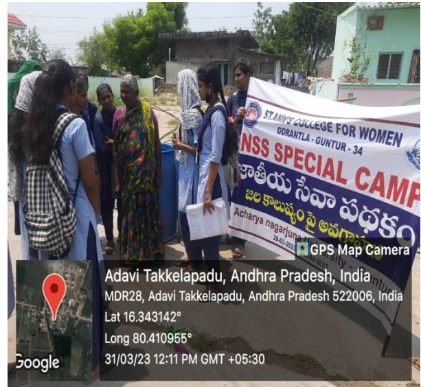
NSS volunteers participated in awareness program on water pollution